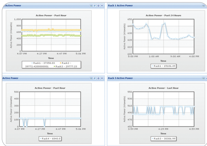
Power IQ Active Power Report

Power IQ calculates how much energy could be saved by increasing temperatures a little more, but within ASHRAE recommendations. By raising temperatures, even slightly, data centers will require less cooling, and in turn, less energy. The thermal analytics feature also can send out email alerts if, for example, any rack goes above threshold conditions as well as provide long-term trend charts.