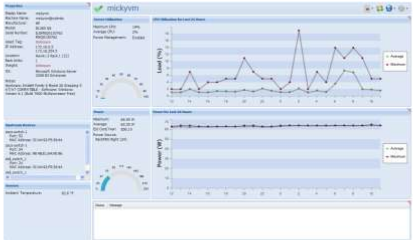
RaMP Server View Dashboard