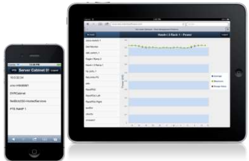
RaMP Handheld Applications