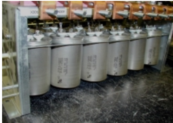
Figure 1 – UPS output AC capacitor bank

Table 3 shows that small changes in voltage stress have the largest affect on power capacitor lifetime when compared with other factors. Note that the steady state voltage across AC capacitors is completely independent of the UPS load and therefore, reducing the load on the UPS will not reduce the voltage stress on the capacitors. This may or may not be the case for transient voltages across the capacitor as it depends on the UPS design. Differences in temperature and current stress for UPS designs have the potential to affect power capacitor lifetimes substantially as well, but their effects are less than when voltage stress is varied. Figure 1 below shows a typical AC capacitor bank, also known as a capacitor rack.